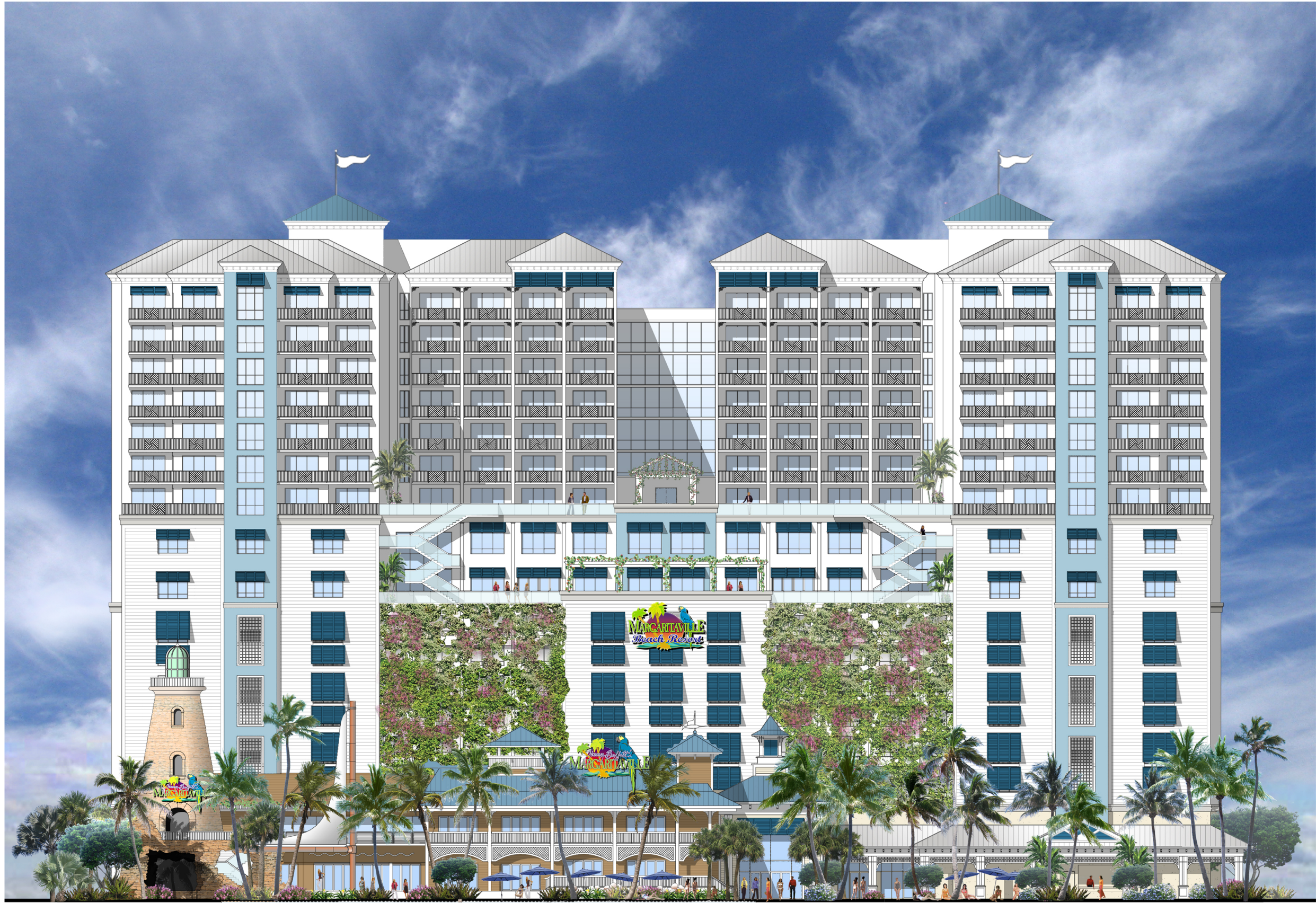
EAST ELEVATION RENDERING